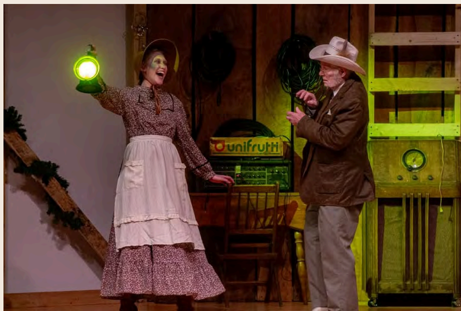
ACT's A Bluegrass Christmas Carol