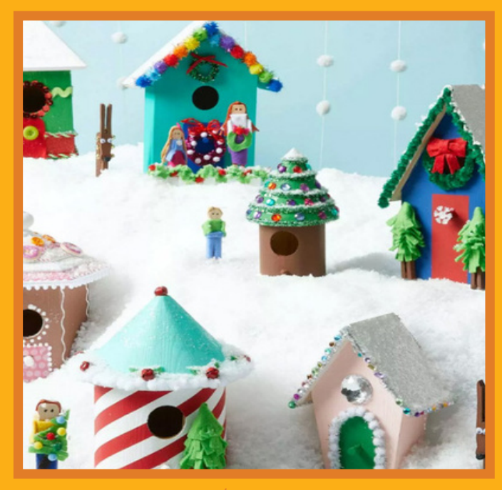
▶ View online at 4-H.org/Village